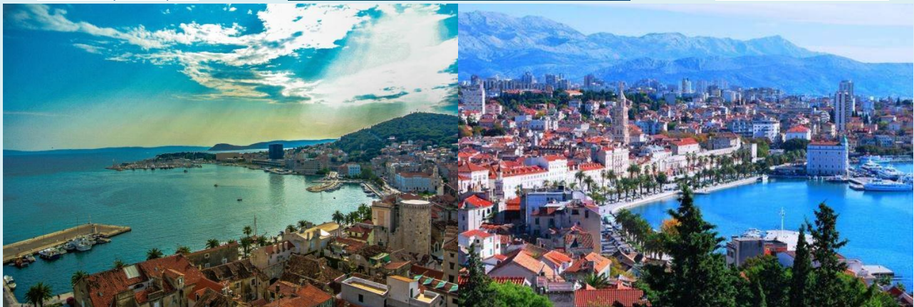
3 above images: http://www.isausm.com/ (accessed 12/11/2017)